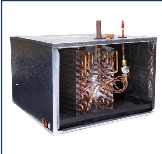
Unit shown with service panels removed. Representative image only. Some models may vary in appearance.